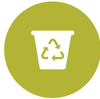
SOLID WASTE MANAGEMENT PLAN