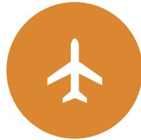
READING AIRPORT AUTHORITY STRATEGIC MASTER PLAN