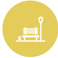
GREENWAY, PARK AND RECREATION PLAN