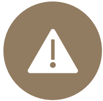
HAZARD MITIGATION PLAN