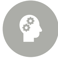
IMAGINE BERKS PLAN