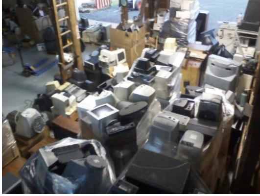
Electronics were previously stored within the collection area.