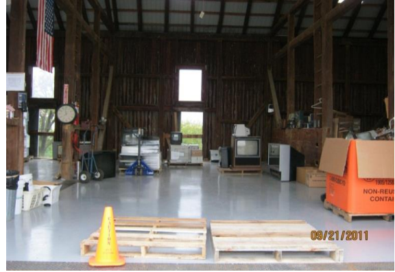
The electronic collection area, after the construction of our new storage building.